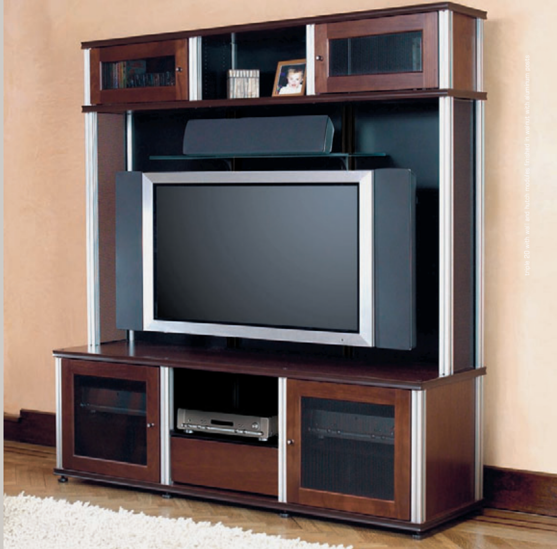
triple 20" with wall and hutch module finished in walnut with aluminum posts