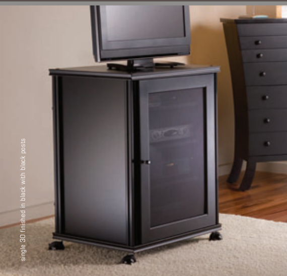
single 30 finished in black with black posts