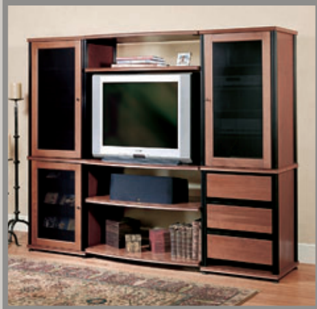
two single 70" towers flanking bridges finished in cherry with black posts

Synergy cabinets can expand horizontally as well as vertically. Special Bridge options span Synergy cabinets so they run along a wall as single, unified forms. Synergy Bridges accommodate just about any widescreen TV, and a second Bridge, above or below the screen, can accommodate a center-channel speaker.