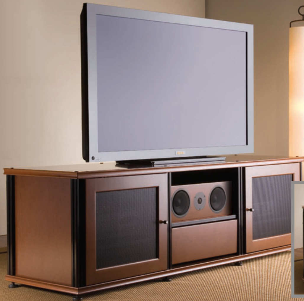
triple 20 finished in cherry with black posts